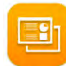
Start without video