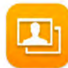
Start with video